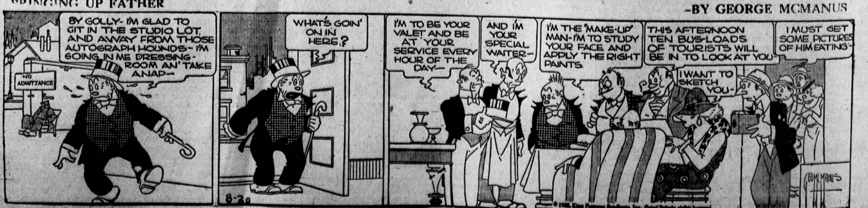
-BY GEORGE MCMANUS

BY GOLLY- I'M GLAD TO GET IN THE STUDIO LOT, AND AWAY FROM THOSE AUTOGRAPH HOUNDS- I'M GOING IN ME DRESSING ROOM AN' TAKE ANAP. WHAT'S GOIN' ON IN HERE? I'M TO BE YOUR VALET AND BE AT YOUR SERVICE EVERY HOUR OF THE DAY. AND I'M YOUR SPECIAL WATER. I'M THE 'MAKE-UP' MAN- I'M TO STUDY YOUR FACE AND APPLY THE RIGHT PAINTS. THIS AFTERNOON TEN BUS-LOADS OF TOURISTS WILL BE IN TO LOOK AT YOU. I WANT TO SKETCH YOU. I MUST GET SOME PICTURES OF HIM EATING.