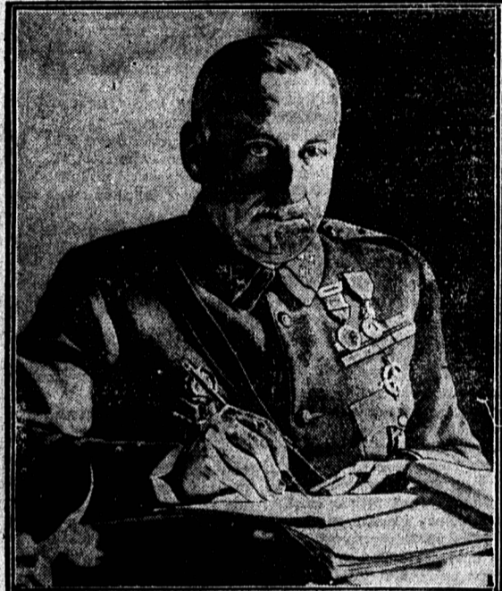
Premier Primo de Rivera, who has ruled Spain as dictator since 1923, has resigned and General Damazo Berenguer, his foe of long standing, has been charged by King Alfonso to form a new cabinet.