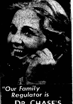
Our Family Regulator is DR. CHASE'S KIDNEY LIVER PILLS

He happened to be stepping off a porch when I caught the small dead animal out doors. He nodded his head in a rejected sort of way and came nearer to examine him. "Elsie," he said "if you had been minding your own business yesterday, instead of your 'kaleidoscope' it would have been yours to keep in your pocket." "But, Polly," I stamped, "Polly," he said, "just like that money trust, you people to do your own work. How many times Elsie, have I told you that? But" "I'm afraid you're not a very good pig-farmer. Looks easy, doesn't it?" Rob suggested that I buy a replacement from him and get into a good breed of hogs. James however, took an altogether different view of the matter.