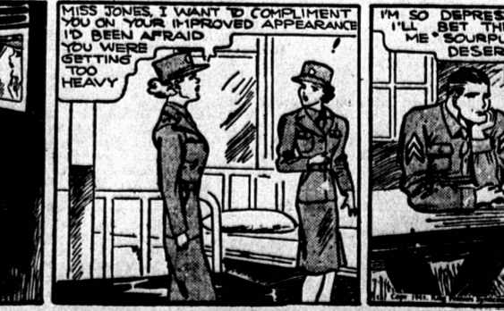
GOSH I CAN'T EAT SINCE I BROKE UP WITH BILL EVERYBODY NOTICE HOW WE'VE WASTING AWAY