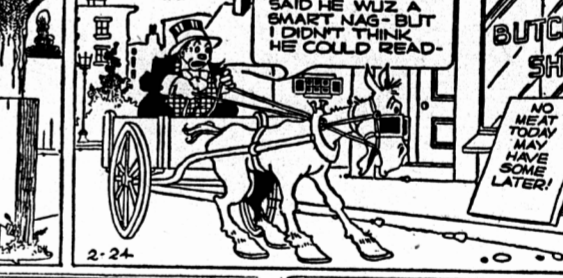
FIPPIE AND "CAL" STUBBS