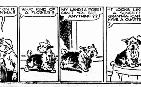
TILLIE THE TOILER IMPROVED APPEARANCES