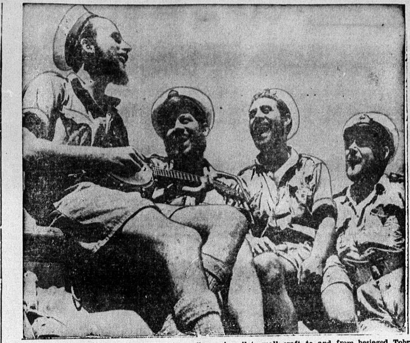
TAHS AT TOBRUK—A quartet of British sailors who pilot small craft to and from besieged Tobruk with ammunition and supplies takes time out from wartime duties, to do a bit of harmonizing as one of them strums the banjo. Barbers, it seems, are a bit scarce.