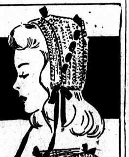
DESIGN NO. E-1268

This sporty twosome will please the younger generation from 6 to 14 years old. Pattern No. E-1268 contains complete instructions. To order pattern: Write or send above picture with your name and address with 20 cents in coin or Postal Scrip to Needlework Bureau, Charlottetown Guardian. Design No. E-1268