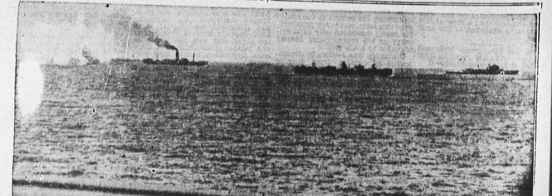
FIGHTING THROUGH—Enemy planes score near misses on ships in a convoy rushing supplies and equipment to an Allied port in the Mediterranean. While convoy suffered serious losses at the hands of enemy planes and submarines, 43 enemy aircraft were shot down.