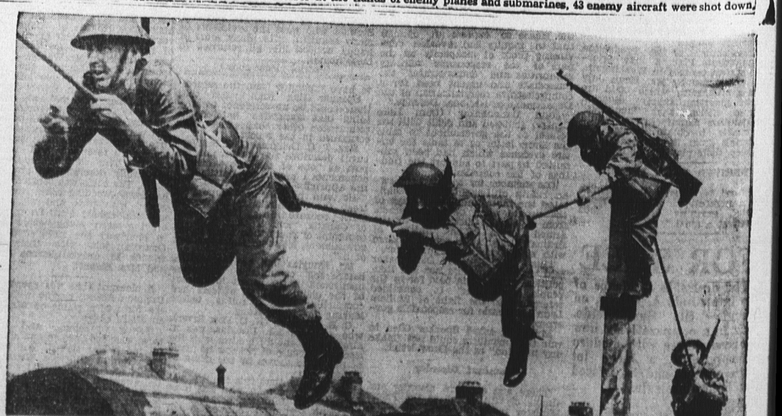
CROSSING VIA "TUG"—There is more than one way to "kill a cat" and there's also more than one way to cross a river. British Tommies in training for invasion of continent cross a body of water via a "tug" with rope.