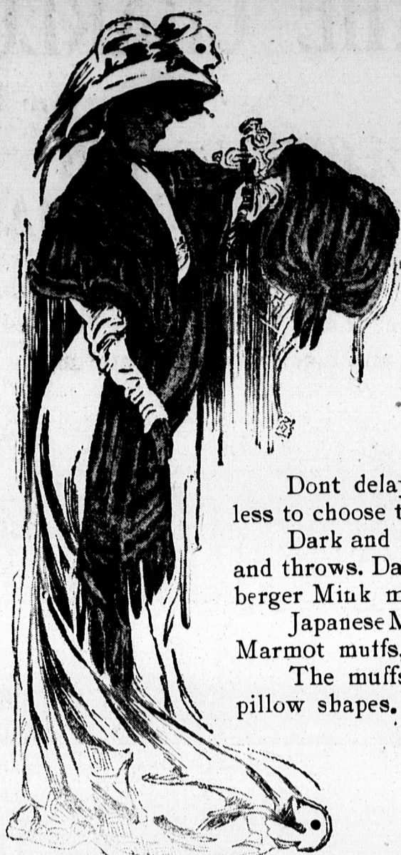
TO BE SOLD.

McLellan Bros Charlottetown's Best Tailor wirtmf