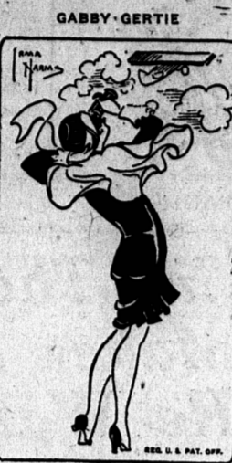
"Endurance flyers give most people a pain in the neck."