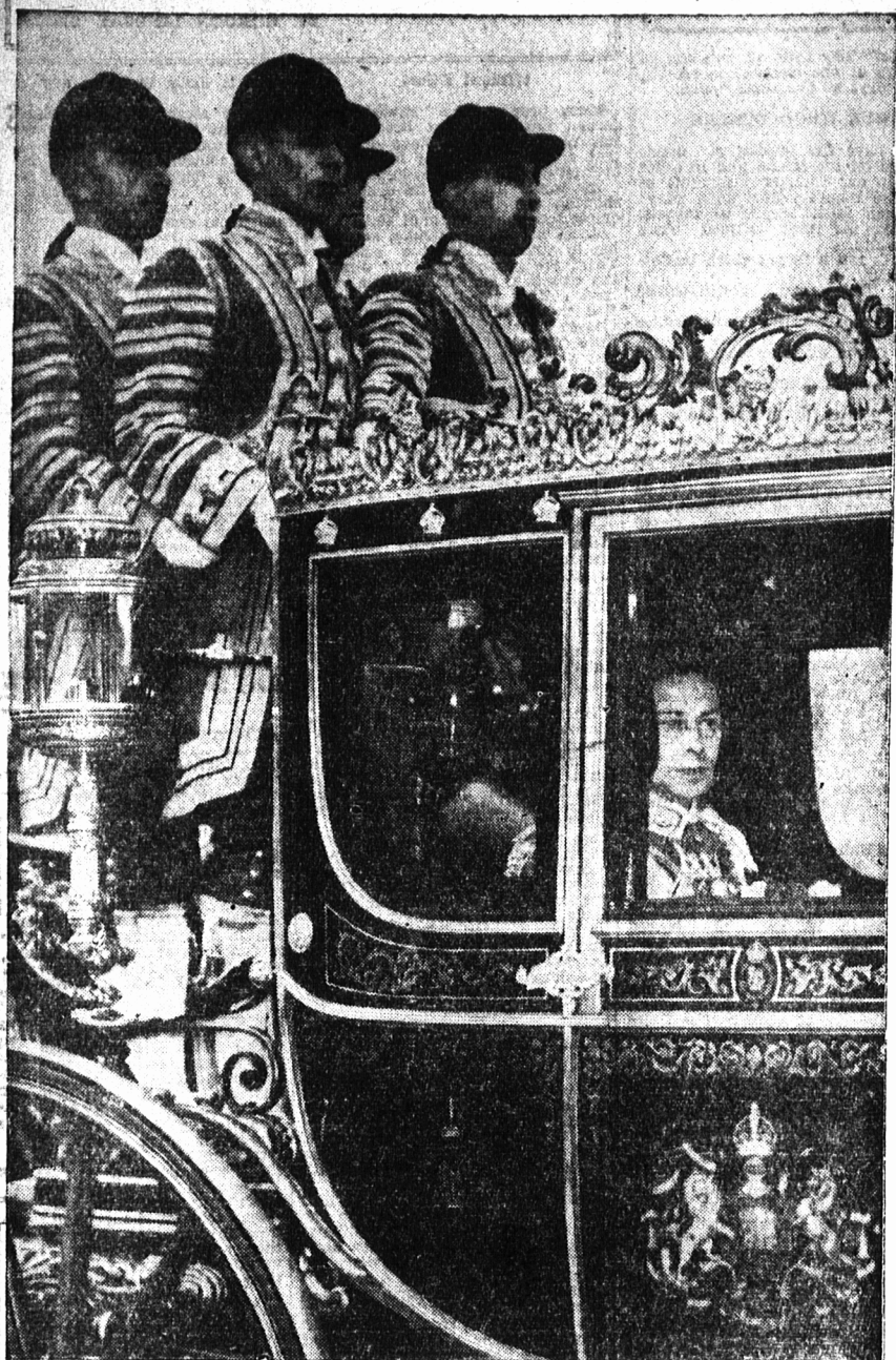
Great Britain's spell of sunny spring weather gave Londoners an unusual sight, a few days ago when the King drove to Buckingham Palace to hold the second levee of the year. Our photo shows His Majesty bareheaded in the State coach drawn by two of the Windsor greys. Accompanying His Majesty is the Duke of Beaufort, Master of the Horse.