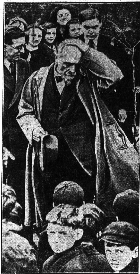
Planting trees appeared to involve as much worry as Britain's financial affairs for Montague Norman. The governor of the Bank of England left his office to plant a beech tree at Wood Lane open air school in London recently. He accepted the invitation partly because his wife is chairman of the board of governors. He himself broke a record recently when he was nominated for the 19th time to head the Bank of England.