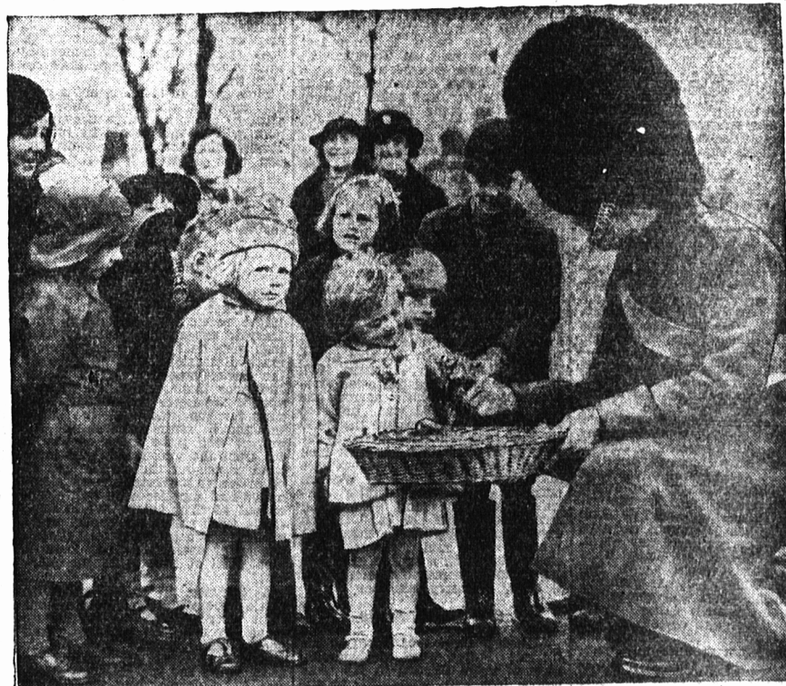
In common with Irishmen and women the world over, the Irish Guards stationed at Catterham Barracks, Surrey, England, celebrated St. Patrick's Day in fitting style and gladdened the hearts of many children when they presented them with shamrock sprigs. Our photo shows the shamrocks being distributed to the children by a Guardsman as the regiment observed the day. A presentation of shamrock was made to the soldiers on behalf of the Princess Royal, honorary colonel-in-chief.