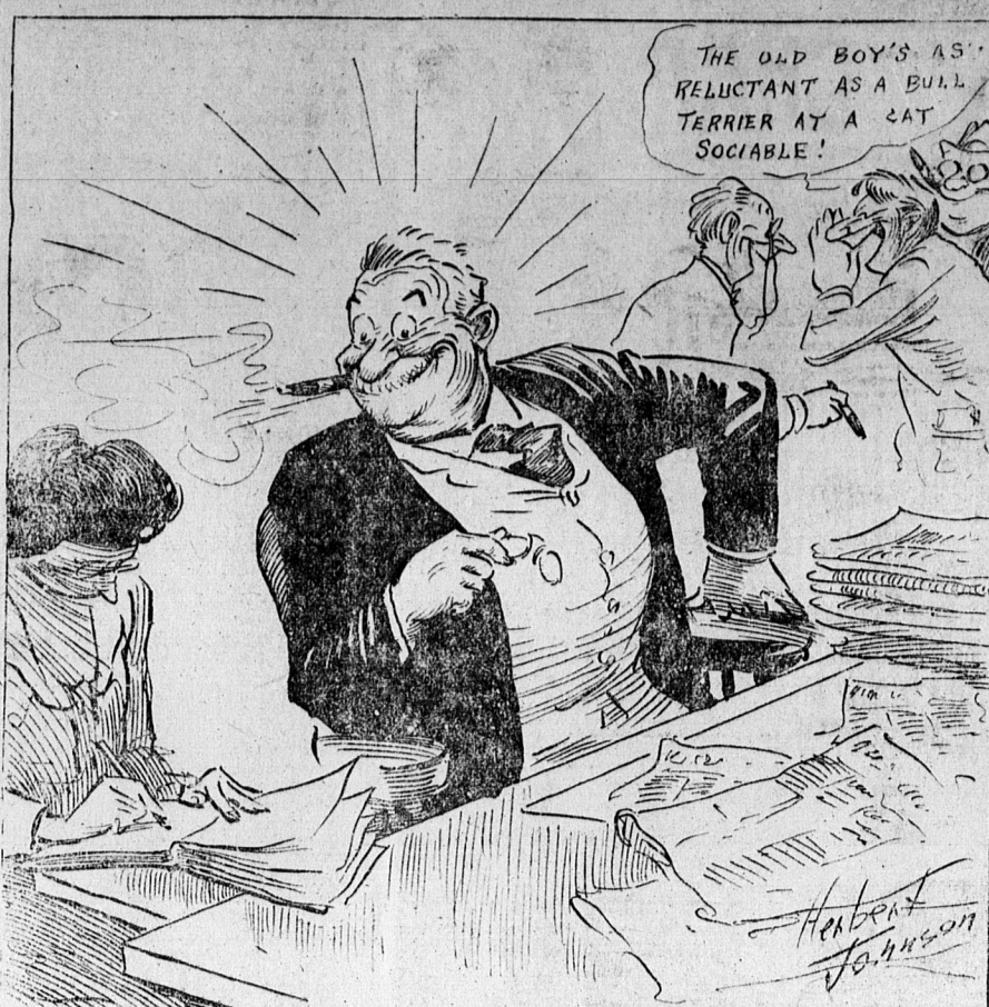
THE OLD BOY'S AS RELUCTANT AS A BULL TERRIER AT A CAT SOCIABLE! HIS PROFOUND MELANCHOLY AS HE DICTATES LOFTY STATEMENT SIGNIFYING HIS RELUCTANT WILLINGNESS TO BE DRAFTED IN THE COUNTRY'S WELFARE AND THE PEOPUL DEMAND OF HIM THIS GREAT SACRIFICE.