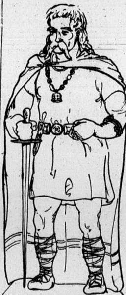
SWORD BELT CHAIN STEEL GRAY, LOOK RED-VAIS TUNIC SHOES, LEGGINGS BROWN-YELLOW HAIR.

Adapted for boys and girls from the great English epic. Adaptation by Taves Maxwell.