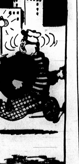
"In answerin' a Guardian Want Ad—why?"