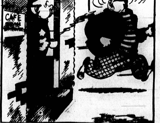
"In answerin' a Guardian Want Ad—why?"