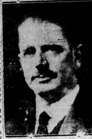
PREMIER OF NEW ZEALAND Hon. J. C. Coates, who has succeeded the late Premier Massey as the prime minister of New Zealand.

(Canadian Press.) HALIFAX, N. S., Aug. 19.—The majestic shade trees, limes, elms and maples, that line so many of the streets of Halifax, are the pride of all visitors, and admiration of all citizens, but it is unlikely any person takes so great a delight in their beauty as Richard Power who lives in a bowered cottage in the angle formed by the intersection of South Park and Sackville Streets opposite the northeast corner of the Public Gardens.