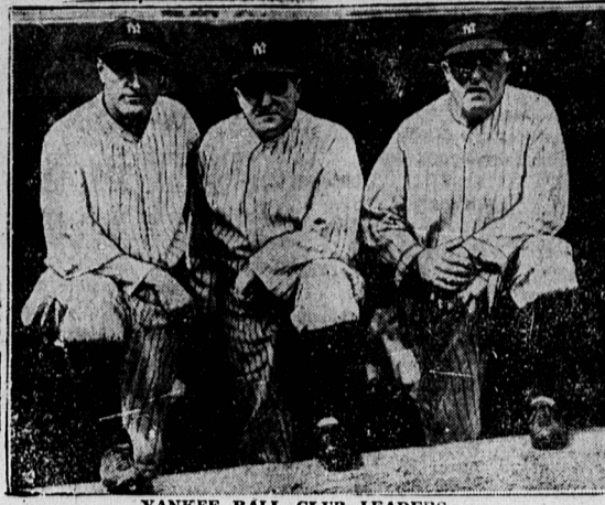
YANKEE BALL CLUB LEADERS