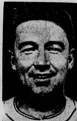
LEO (GABBY) HARTNETT Catcher Cubs