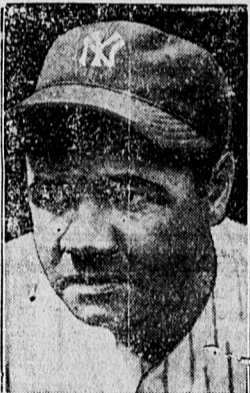
BABE RUTH Yankees

Will be out of game today through illness, but may return to lineup before series is over.