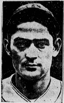
GUY BUSH Pitcher Cubs

The probabilities are that fast balls, shoulder high and inside the plate, high and outside the park, will play a much more strategic part in the World Series between the Yankees and Cubs, starting this afternoon in the Yankee Stadium, than any master-minding from the dug-out or on the ball fields.