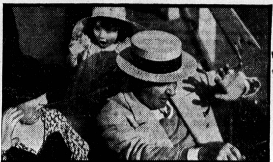
He will never take chances on worn tires again