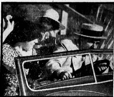
A BLOW-OUT—tragedy takes the wheel

ANOTHER TRAGEDY—THE POLICEMEN SEE PLENTY OF THEM