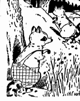
Three-legs followed at his heels

"Go on," growled Three-legs again as the young Coon scrambled up the rocky steep bank. Three-legs followed at his heels. At the top they stopped to look down to the edge of the water. From a shallow hole in the bank close to the water a delectable smell, came up to them. That it was a delectable smell for anyone who likes fish, and the Coon folk dearly love fish.