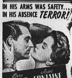
IN HIS ARMS WAS SAFETY... IN HIS ABSENCE TERROR!