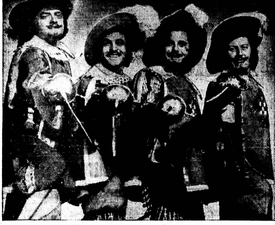
"One for all... and all for one!"

M-G-M presents Alexandre Dumas' The Three Musketeers starring LANA TURNER, GENE KELLY, JUNE ALLYSON, VAN HEFLIN, ANGELA LANSBURY. Color by Technicolor.