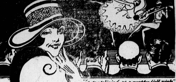
Jewel Incorporated Presenting Lois Weber's Big Dramatic Treat for the Whole Family