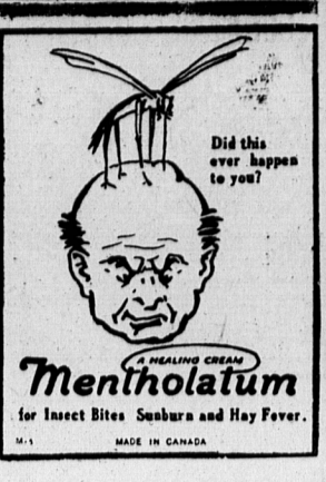
Did this ever happen to you? Mentholatum for Insect Bites Sunburn and Hay Fever.

It relieves at once and gradually heals the skin. Sample box of Dr. Chase's Ointment free if you mention this paper and send 5c stamp for postage. See a box at all dealers or Edman, Bates & Co. Limited Toronto.