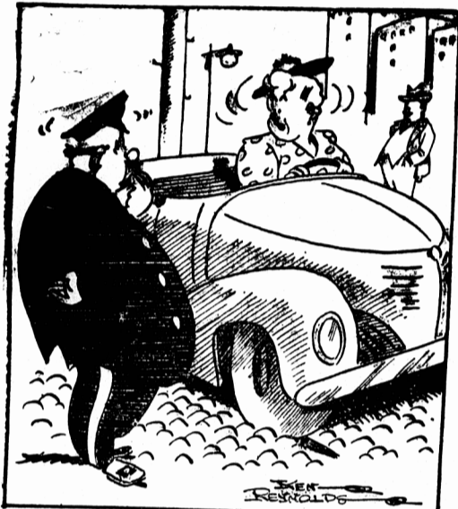
"What fire!—I'm answerin' a Guardian Want Ad!"