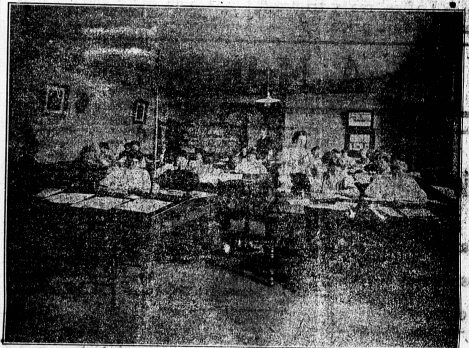
Partial view of Class-room of Charlottetown Business College.

the BEST EQUIPPED Colleges in the Province