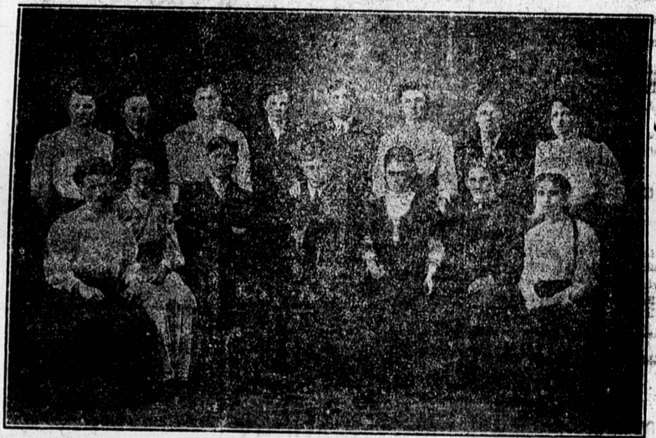
Some of the last term students of the Charlottetown Business College

GOLD and SILVER MEDALS for deserving pupils