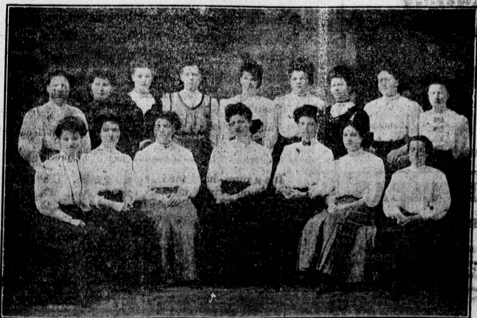
Some of the last term students of the Charlottetown Business College