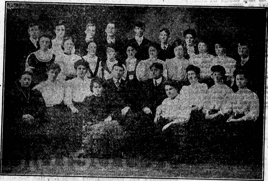
Some of the last term students of the Charlottetown Business College

Experienced and Practical Male Teachers at the head of Every Department