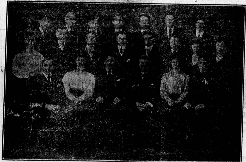
Some of the last term students of the Charlottetown Business College

$135 Typewriter FREE and a fund of tuition under certain conditions