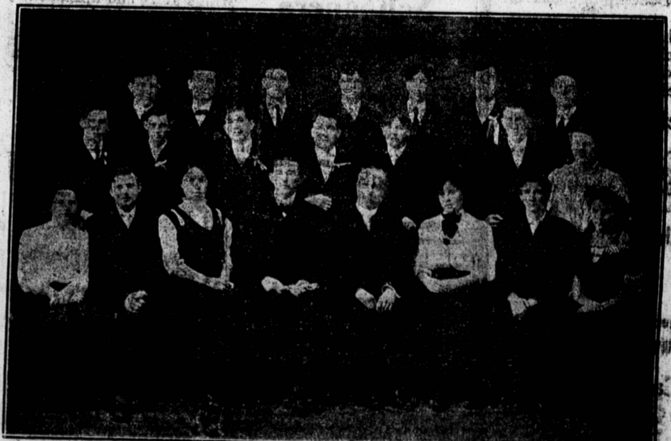
Some of the last term students of the Charlottetown Business College