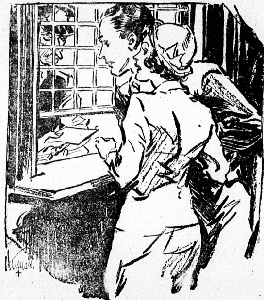
Apparently, the station agent was the last person to have seen Lawson Whittaker

CHAPTER IV "But why," Johnny asked, for the tenth time, "did he see Sig Borndike off like that, and then vanish?" He and Alma had been questioning the agent at the railroad station, and had learned that Lawson Whittaker had spent twenty minutes there with Sig before Sig left for Chicago. The two men had apparently been expecting someone else, because, just before the train came in, the agent had heard Sig say, "Looks like she isn't coming," and Lawson Whittaker had answered, "She may at the last minute, Sig." Johnny wrenched his gaze away from the suffering in her eyes and stared at the scuffed tips of his golf shoes. Deep in his heart, he knew why. And sooner or later, Alma would need to know. Johnny had had the first inkling of what was wrong when he had gone back to the drugstore alone to question the clerk, Jed Turner, who had been Lawson Whittaker's right-hand man