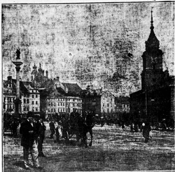
A street scene in Warsaw, capital of Poland, which has been captured by the rebels under Marshal Pilsudski, who holds as prisoner some of the ministers of the ousted government, but has permitted the deposed President to retire to the Presidential summer palace. About 200 are reported to have been killed in the street fighting.