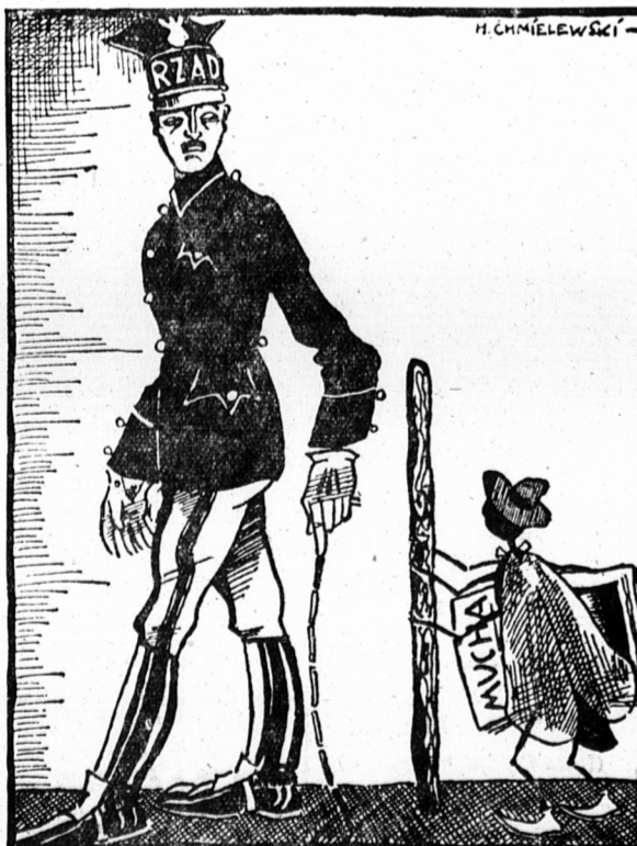
"Mucha's" advice to the Polish Foreign Minister was disregarded by that official but was heeded by Pilsudski, successful leader of the revolt, who is proclaiming himself dictator. The advice was: "Throw away that useless little cane, and support yourself with the big stick as Mussolini does in Italy."