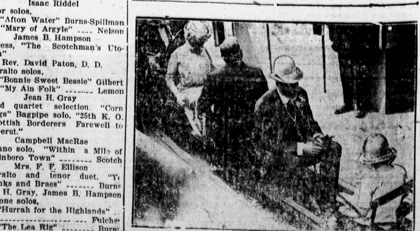
KING RIDES ON MINIATURE RAILWAY Cheer after cheer was given when Their Majesties inspected the Canadian Pacific Railway's Miniature Station at Warshaw.