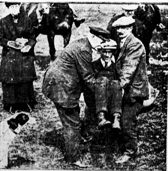
DUNTING IN THE GOOD OLD STYLE

The Freeholders of Newbiggen-by-the-Sea rode and perambulated the "nuts and raisins" were of which they are the Lords of the boundaries of Newbiggen Moor. A Freeholder was duly initiated Manor. According to ancient custom which according to local history distributed along the route and four and five hundred years by "dunting" on the Dunting Stone of "Dunting" one of the new Free has been in use as such, between The photograph shows the process holders on the old dunting stone.