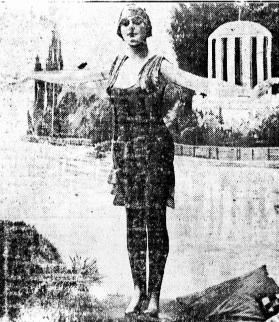
All the freak bathing suits are not exhibited at Atlantic City or Palm Beach. Here is one of the latest English novelties which will be seen at English seaside resorts this season.