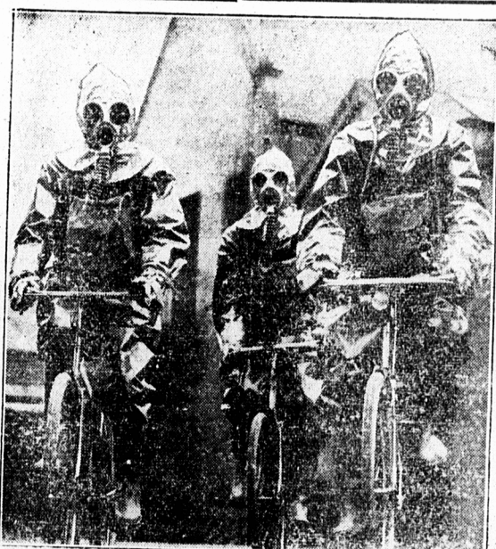
English constables, mounted on bicycles and equipped with anti-gas suits and masks, going their rounds in Wakefield England, as part of preparedness exercises they are being given.