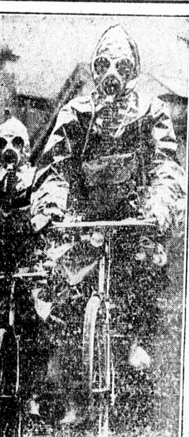
English constables, mounted on bicycles and equipped with anti-gas suits and masks, going their rounds in Wakefield England, as part of preparedness exercises they are being given.