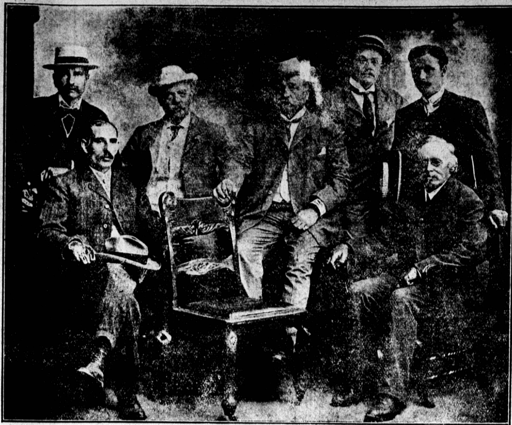
Executive Committee of the Fish and Game Protective Association which held its annual meeting last night.