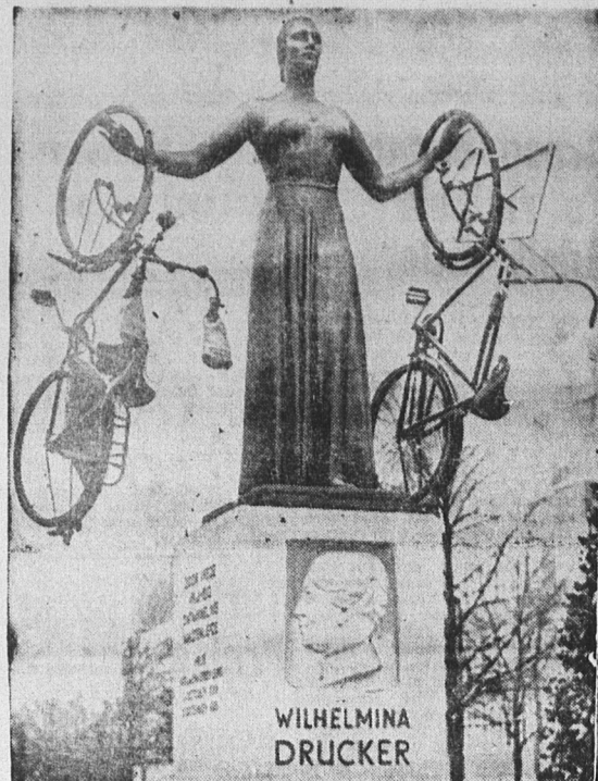
Dutch bicycle owners who violate the rigid blackout violations by leaving their vehicles where pedestrians may stumble over them, sometimes find their cycles hanging from trees, lamp posts or statues. This statue in Amersfoort, Holland, honors Wilhelmina, queen of the Netherlands.