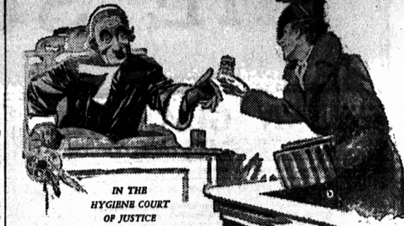
IN THE HYGIENE COURT OF JUSTICE