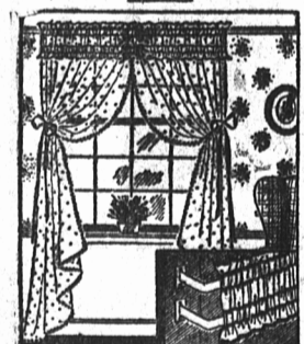
"Cornice" Style Clever, Easy

Brighten Rooms With Quickly Made Curtains