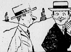
"Se you're back from your rest are you?" "Not exactly. I'm back for my rest."