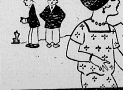
"Well?" "I wonder if it would be any use to try a follow-up system."