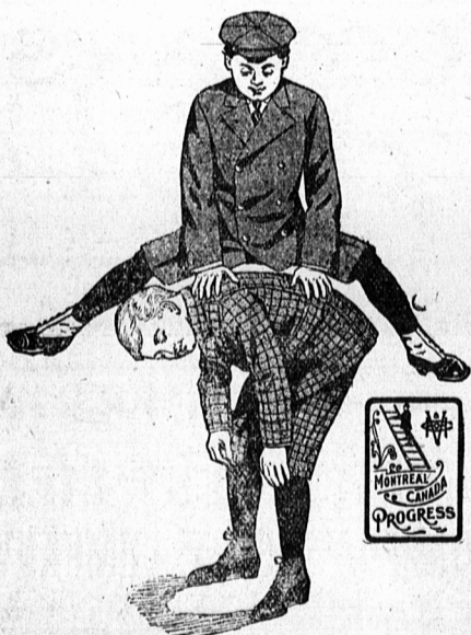
The Treatment Usually Accorded Boys' Clothing

Suits In the nattiest of tweeds, in the best quality, fast colors, also Navy Blue and Black. Spring Overcoats They are all here. Some are short, some medium length, and some are long. The fabrics are Homespuns, Chevrons an Vicunas. Come and have a look. $9 to 18.00 Price to $5 to 20.00