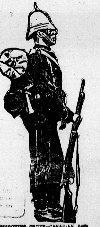
MARCHING ORDER--CANADIAN BARRACKS.

OTTAWA, July 24.--The union meetings in Ottawa of the Brotherhood of Locomotive Engineers and of the Grand Auxiliary, composed of the wives and female relatives of the railway men, were concluded today with a union picnic and program of sports in Rockcliffe Park.