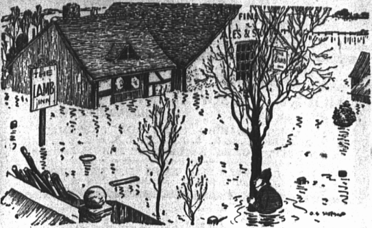
"Whatever the weather, he comes sneaking round to see if anybody is in here after closing time." Humourist.