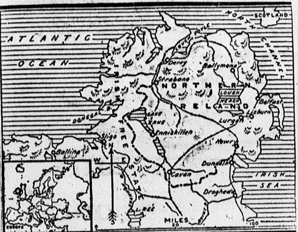
THE IRISH BOUNDARY DISPUTE

This map indicates the present division between Ulster and the Free State, which, it was reported, had been settled in conference between Craig and Cosgrave. An unqualified denial of this agreement comes from Premier Craig.