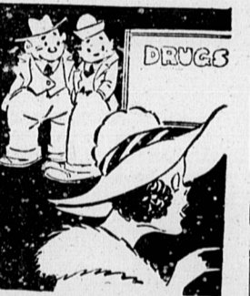
"She's the limit at flirting with soda-water clerks."