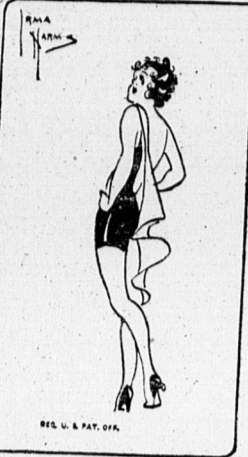
"A beauty contest is something that a comely girl comes through in good shape."