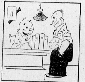
"My wife reads the marriage notices carefully every day. Wouldn't miss a day for worlds."