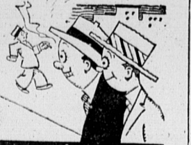
"I knew that man when he didn't have a dollar he could call his own."