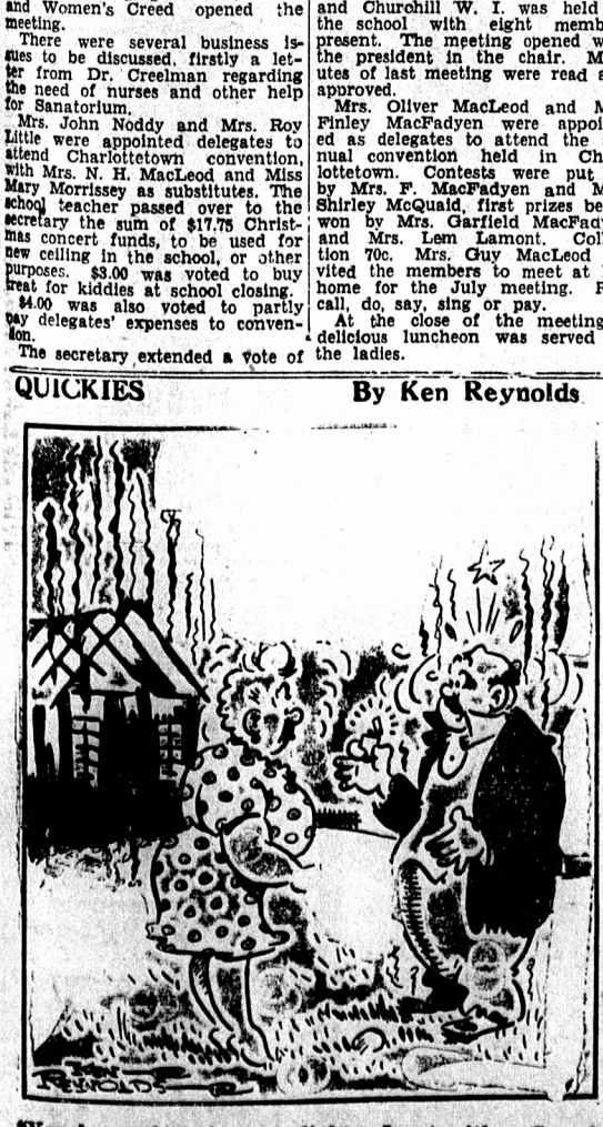
"You know that cigarette lighter I got with a Guard. I want Ad-well, it works!"