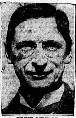
PRIME MINISTER DE VALERA, EIRE

By GEORGE HAMBLETON Canadian Press Staff Writer