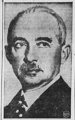
Still in Britain's corner is Premier Ismet Inönü of Turkey, above, even after receiving note from Nazis promising to be nice.