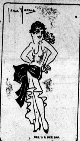
"When a man is nobody's fool it's because he isn't claimed by anybody."