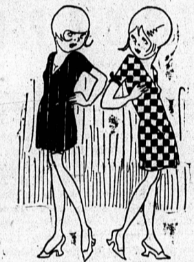
"Jack proposed to Miss Antique last night. Must have been a case of love at first sight." "I'd say he was near-sighted."

ON THE GRIDIRON Thought to come back Some find it tough A quarterback Is quite enough.