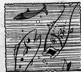
"She's a gossip, a regular shark for news." "Yes, always poking her nose in other people's affairs."