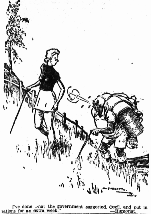
I've done what the government suggested, Cecil, and put in nations for an extra week. —Humorist.