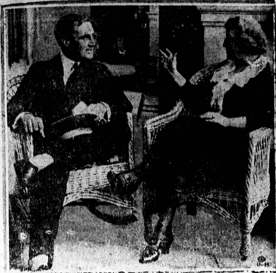
DEMOCRATIC WOMAN LEADER IN CONFERENCE WITH FRANKLIN D. ROOSEVELT IN NEW YORK.