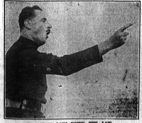
SIR OSWALD LAYS DOWN THE LAW Sir Oswald Mosley, wealthy leader of the British Blackshirts, was caught in this characteristic attitude when he addressed a meeting of his followers recently.