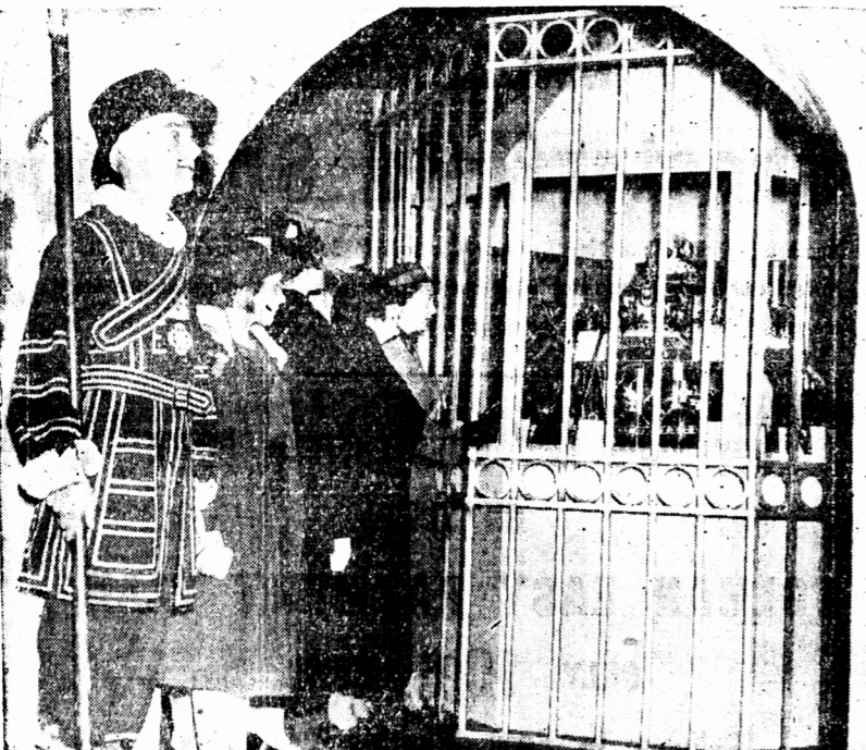
Beekeepers are on guard while visitors line up to see replicas of the crown jewels on exhibition. Recently newspapermen saw the real jewels behind steel bars and bullet-proof glass in a case which can disappear beneath the floor. No photographs were permitted.