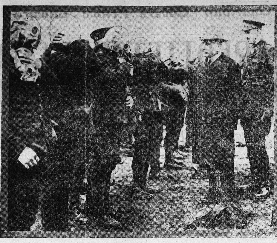
While in England Sir Robert Borden inspected Canadian troops in their gas masks. He seems greatly interested.