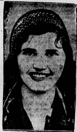
LATEST IN LECTURE TOURS Miss Jennie Lee, aged 27, Labor member of the British parliament at the age of 24, who says she is going to run again, is making a lecture tour of the United States.