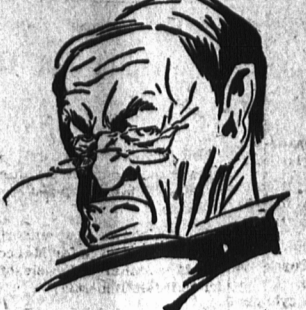
Who Said Dinner?