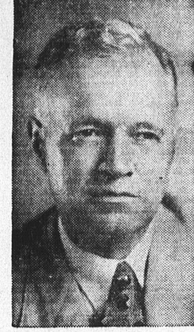
Col. R. J. Manion, M. D., Director of Civilian Defence For Canada who arrived here last night.

Recognize Value Of Air Cadets Urges Suspension Of U. S. Freight Rate Increases