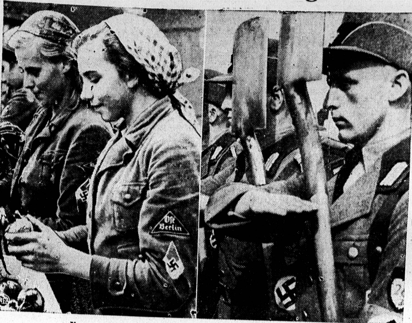
Young women and young men in the German government service.

By MAJOR PAUL L. REED NEA Special Correspondent. The President's proposal for compulsory government service for American youth apparently borrows from the new German theory that old-fashioned straight military training is not enough.