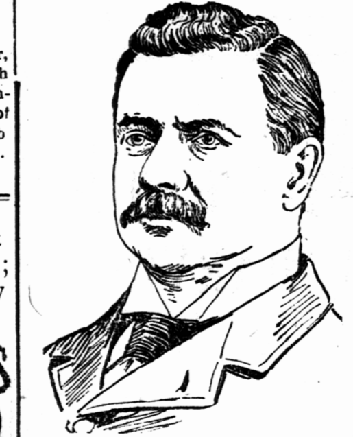
MR. SETH LOW.

Some one has ventured the remark that insomnia is a malady the Southern King's Board of Trade are immune against. However it has been stated on good authority that if a surgical operation could only be effected and the entire body inoculated with some of the entraining blood of Souris Board there might be some hope of having two regular trains on the Georgetown branch throughout the year. It is safe to say that there is more business done on this end of the road during the winter than there is on the entire system combined during the year. Sleep on.